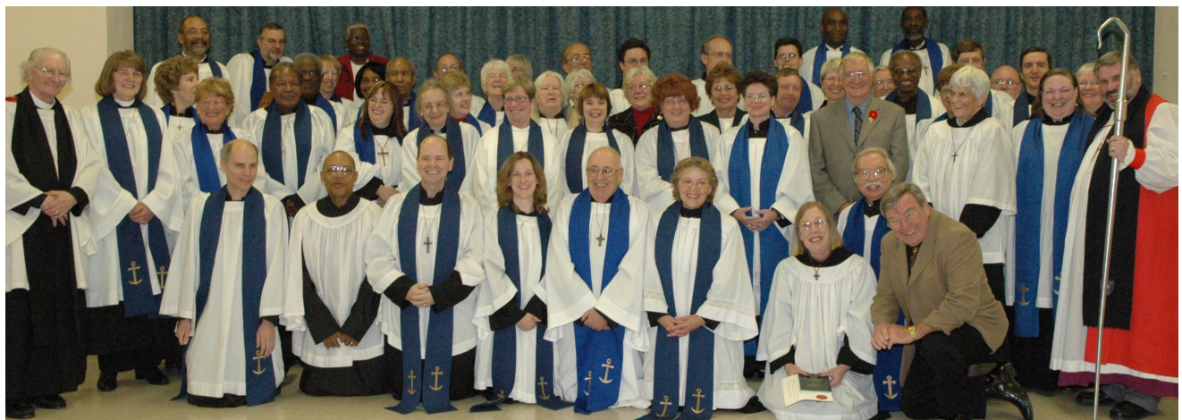
Lay Readers are assembled for the traditional picture just after the Commissioning service.